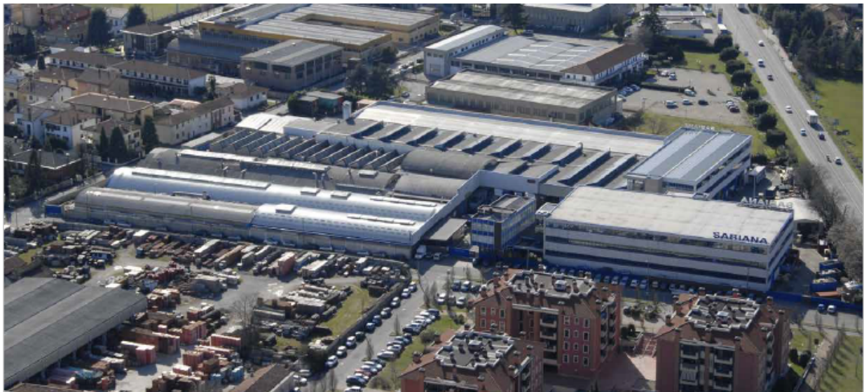
Aerial view of Sabiana headquarter

Sabiana 2 and 3: via Virgilio 2, 20013 Magenta (MI), Italy